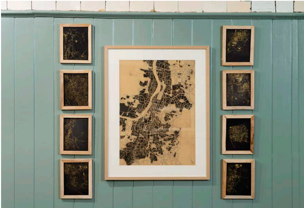
Nidhi Khurana, 'Kolkata Black, 71 x 57 cm, 2017, Natural dyes and stitching, courtesy of Nidhi Khurana

In a portfolio which spans drawings, textiles, carpets, prints, artist books, and sculptures, Khurana has developed a process wherein the artistic idea determines the material and medium of her work. The exhibition encompasses natural dyes, 24-carat gold and silver, handmade paper, slate and silk. Much of the material used in the larger quilted works is recycled cloth scraps collected from tailors and larger pieces of fabric from the numerous second-hand cloth markets.